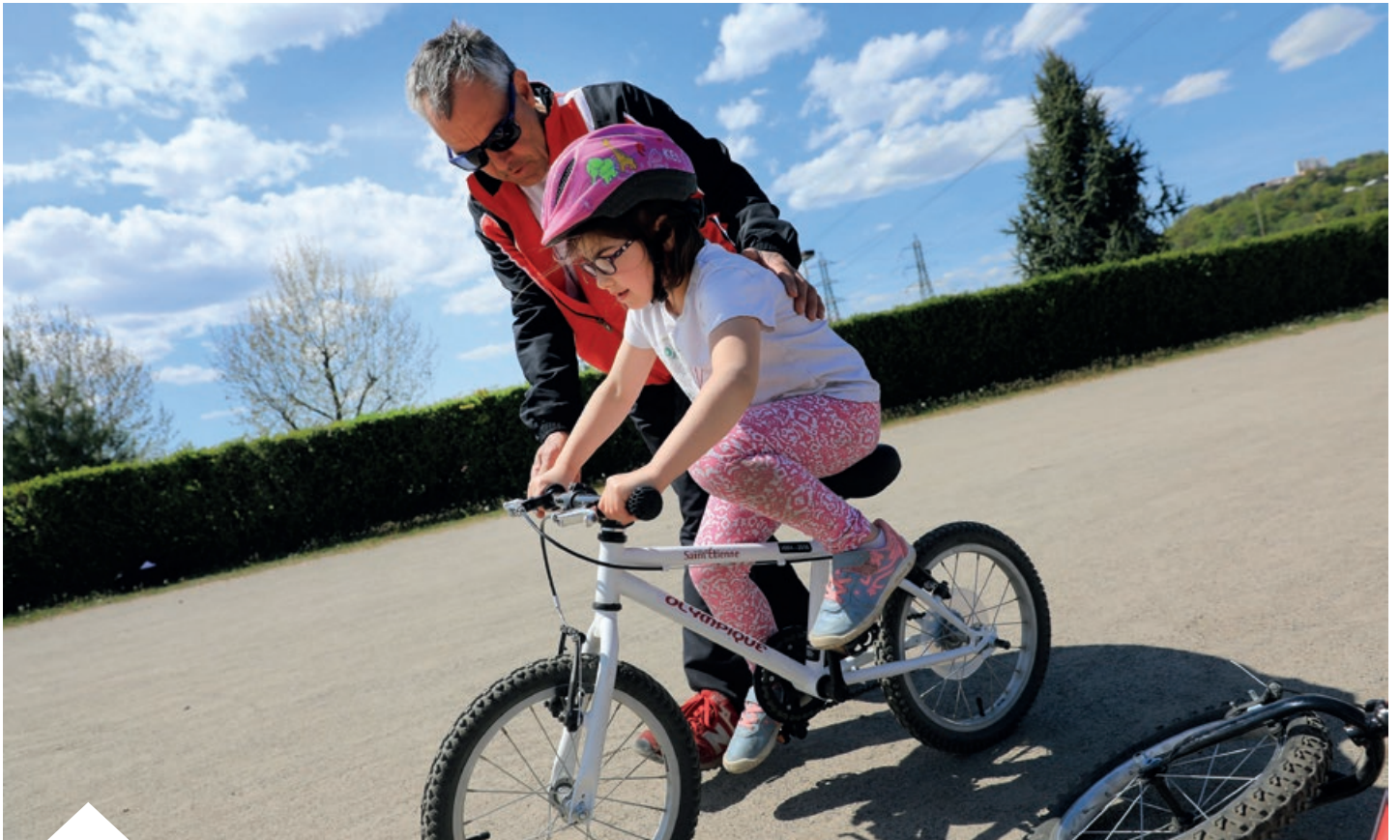
École municipale des sports baby vélo.

Every year, 100 classes and 2,800 children in Saint-Étienne participate in cycling proficiency workshops at the municipal sports school. They are taught by trained city staff, who provide support for school teachers. Saint-Étienne also provides sessions outside school hours on Wednesdays and during the school holidays.