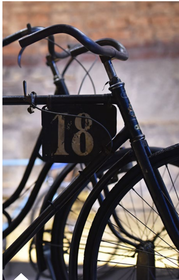
Salle d'exposition du Musée d'Art et d'Industrie Direction de la Communication VSE - SEM.

Nowadays, Saint-Étienne is still renowned for its know-how in the cycle industry, and many companies in the area enjoy an international reputation. Among the best known are Stronglight, world specialist in chainsets and chainrings, Tonic Cycle, frame manufacturer and Cycles Mercier - France Loire, which assembles and equips bicycles, including the famous Vélo'V de Lyon.